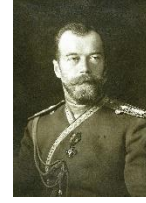
Emperor of Russia