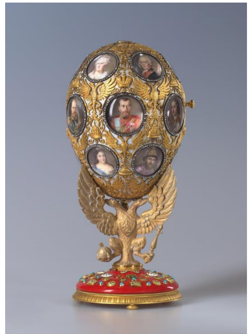
Faberge Egg – made for the imperial family by Peter Carl Faberge