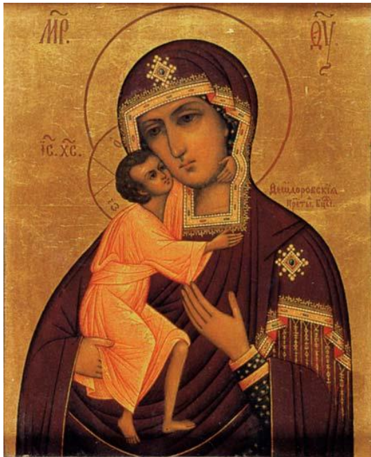
Icon of the Feodorovskaya Mother of God – one of many icons placed in the Alexander Palace by the Empress herself.