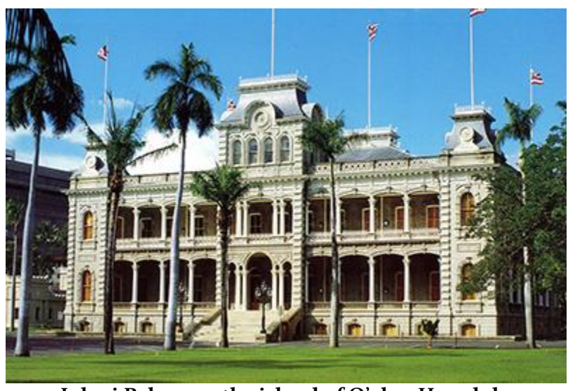
Iolani Palace on the island of O'ahu, Honolulu