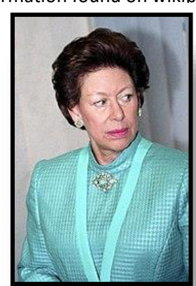
Information found on wikipedia