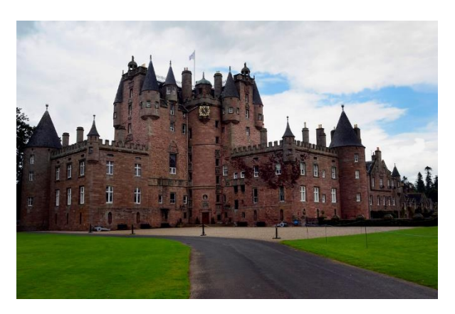
Glamis Castle in Scotland, where Margaret was born