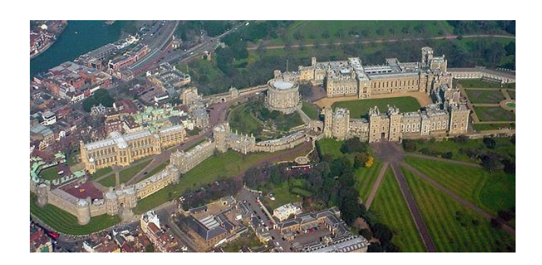
Windsor Castle, namesake of the royal family