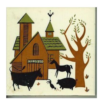
Pilkington English Art Ceramic Tile 1950s Farm Scene