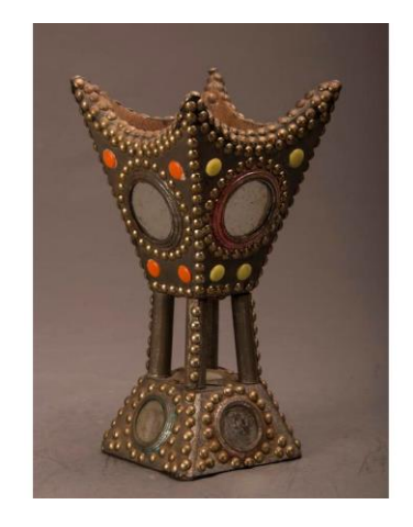
1950s English Tramp Style Figurine