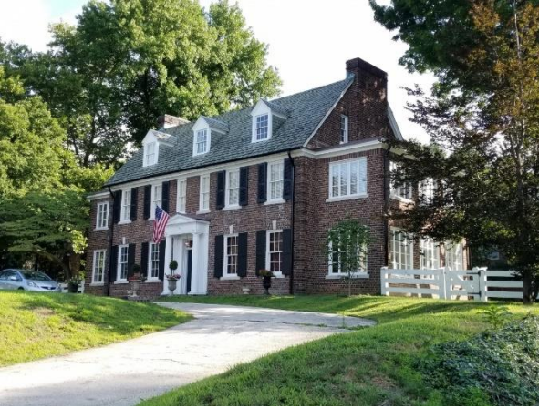
Grace Kelly's childhood home in Philadelphia