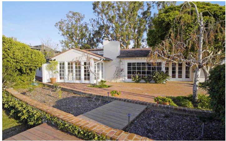
Grace Kelly's estate in Pacific Palisades – lived in while she filmed