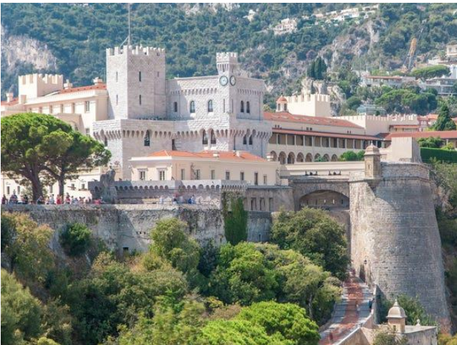
The Prince's Palace in Monaco