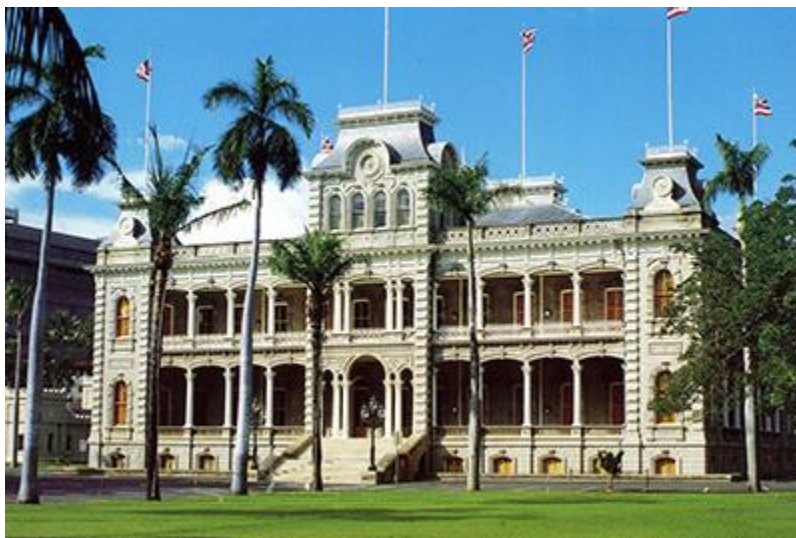
Iolani Palace on the island of O'ahu, Honolulu