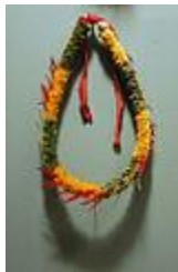
Lei Hulu (feather lei), Hawaiian Islands, 19th century, 'i'iwi, 'ō'ō, and 'ō'ū feathers,