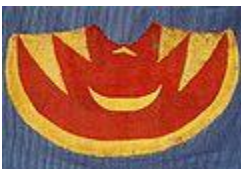
19th-century native Hawaiian feather cape ('ahu'ula)