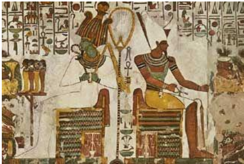
Osiris and Atum painting in the tomb of Nefertiti

" (The deceased asks Atum) : "What will be the duration of my life" - so said he Atum: "You shall be for millions on millions of years, a lifetime of millions of years. I will dispatch the Elders and destroy all that I have made; the earth shall return to the Abyss, to the surging flood, as in its original state. But I will remain with Osiris, I will transform myself into something else, namely a serpent, without men knowing or the gods seeing. (68) "