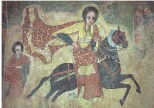
The Queen of Sheba from Ethiopian fresco (c. 1100s-1200s), Lalibela, Ethiopia.