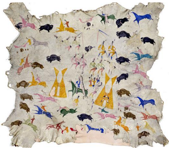
Shoshone Hide Painting of the Sun Dance