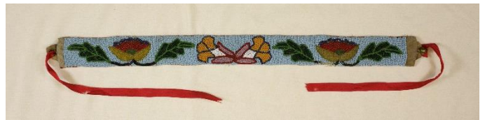
Shoshone beaded belt, possibly similar to the one Sacagawea traded during the expedition.