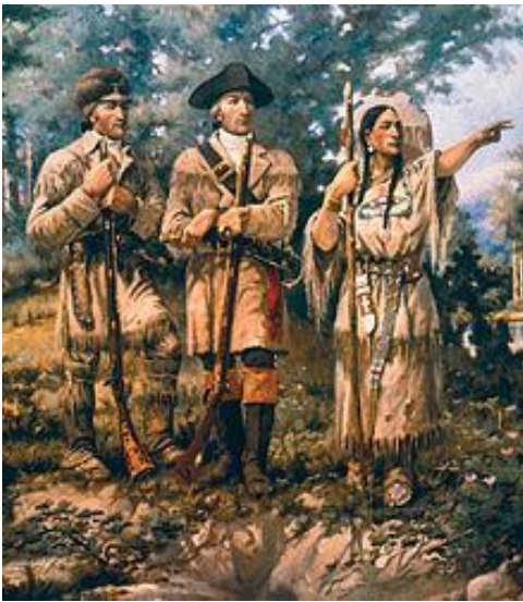
With Lewis and Clark at the Three Forks, mural at Montana House of Representatives

Sacagawea is most well known for traveling with Lewis and Clark across the Louisiana Purchase. She was an interpreter and symbol of peace and friendship during the trip. She and her family made a lasting bond with William Clark.