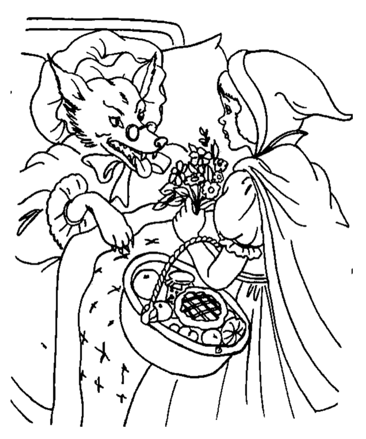
Little Red Riding Hood