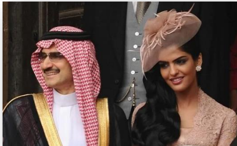
Prince Al-Waleed bin Talal al Saad and Princess Ameerah al-Taweel in 2011 at the wedding of the British Prince William and Kate Middleton.