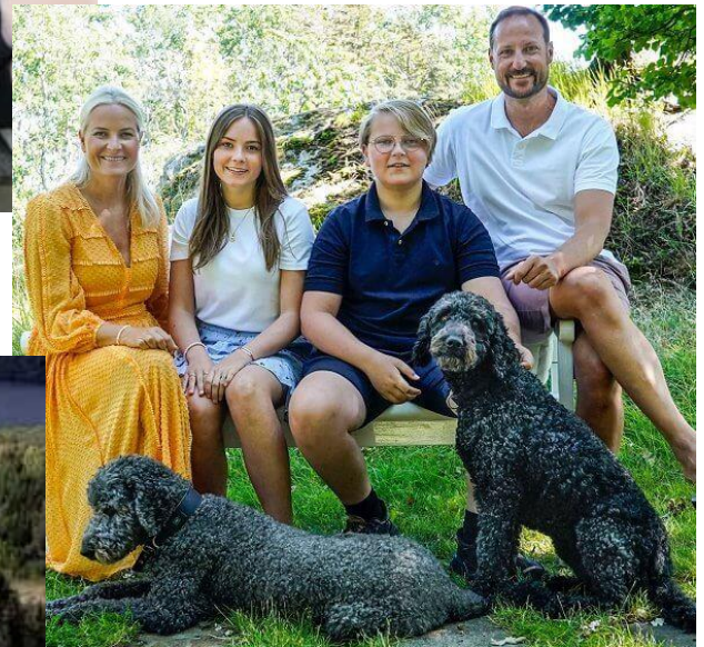
Below: the Skaugum Estate, the family's residence