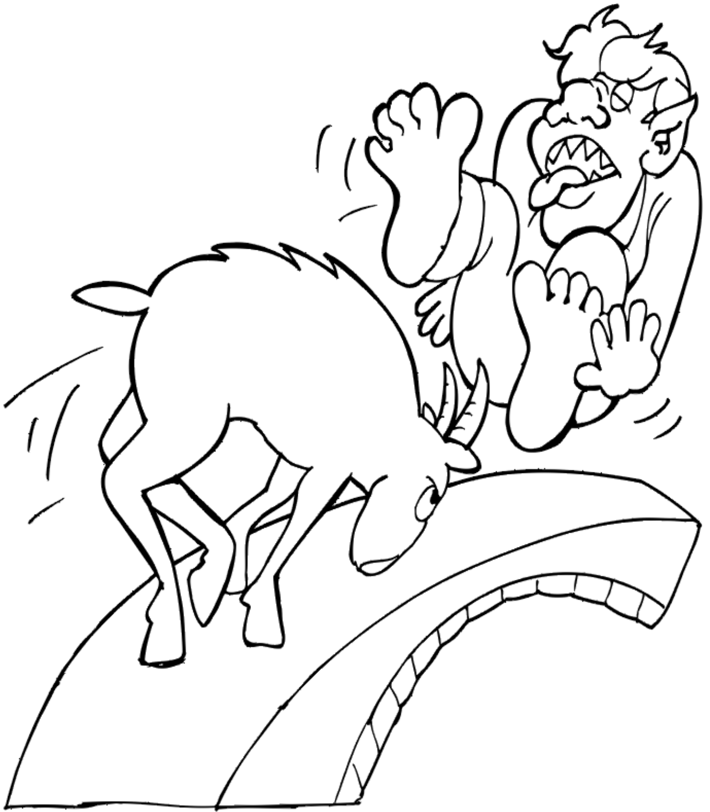
The Three Billy Goats Gruff