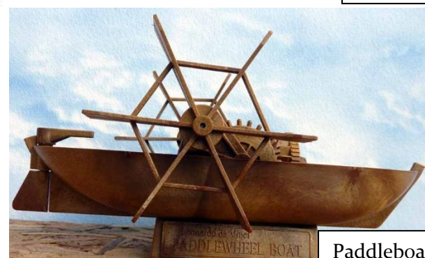
Paddleboat / Warship