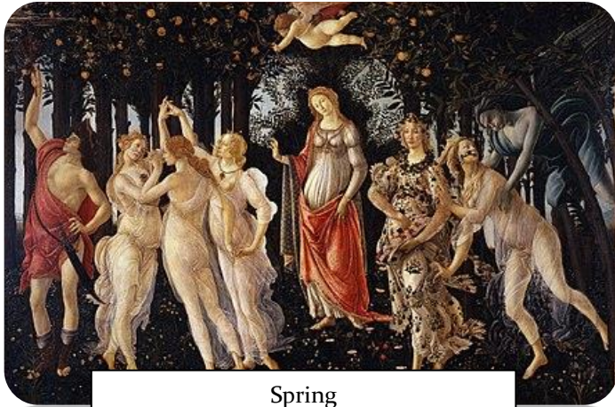
Spring 1480 by Sandro Botticelli