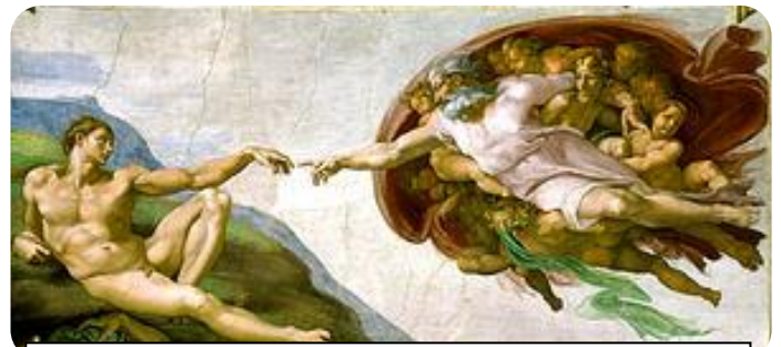
The Creation of Adam 1511, from the Sistine Chapel ceiling, by Michelangelo

Katie and the Mona Lisa By, James Mayhew