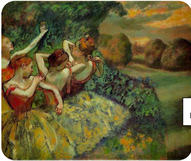
Four Dancers by, Edgar Degas 1899