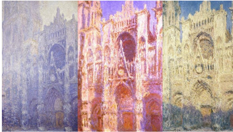
Cathedral series by, Claude Monet 1893