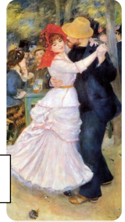
Dance at Bougival by, Pierre Auguste Renoir 1883