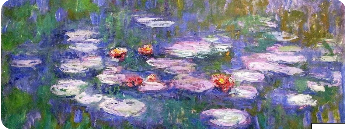
Water Lilies by, Claude Monet 1926