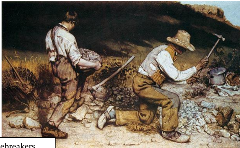
The Stonebreakers by, Gustave Courbet 1849