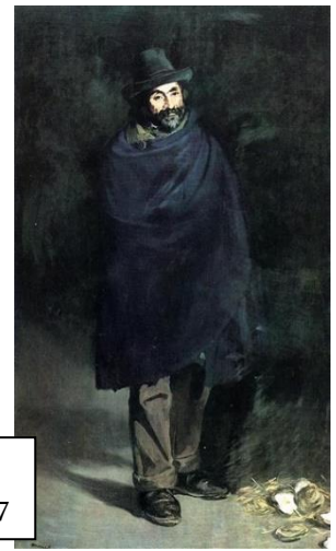
The Philosopher by, Edouard Manet 1867

Art Movements in History - Realism Art - WorldAtlas