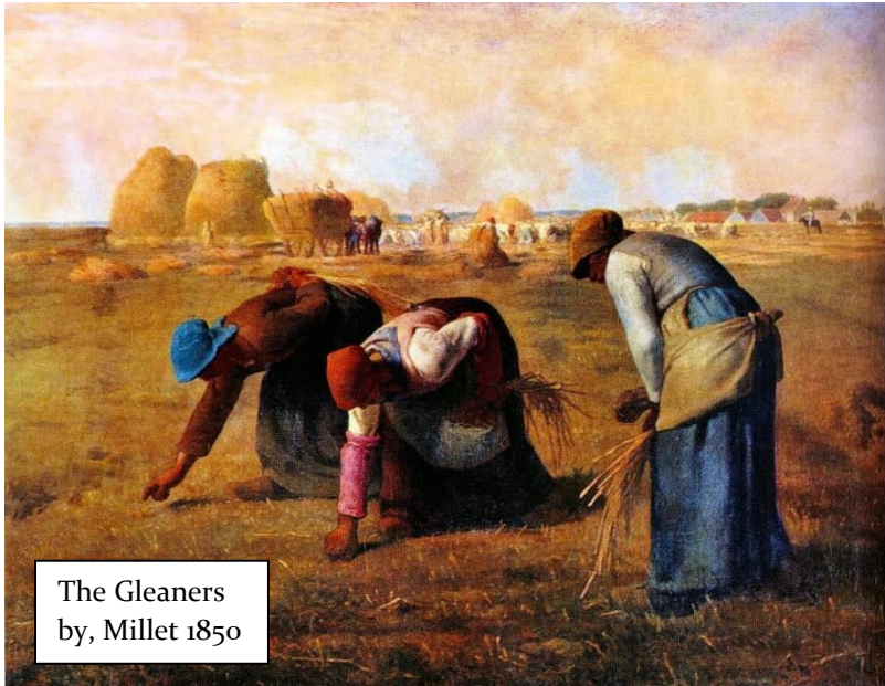
The Gleaners by, Millet 1850