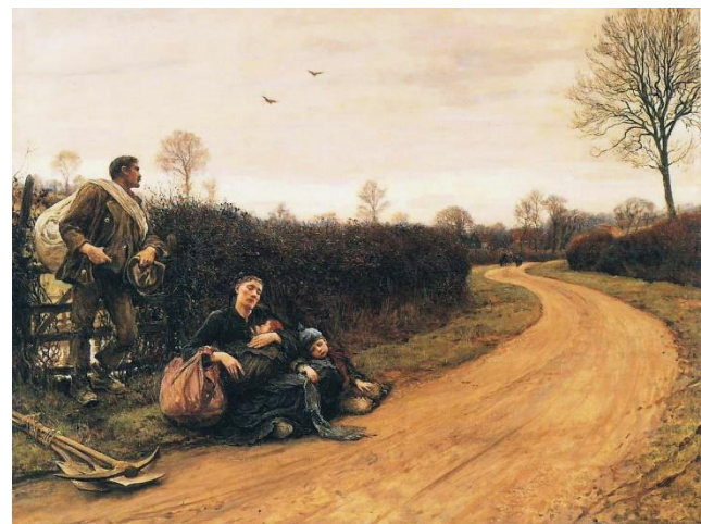
Hard Times by, Sir Hubert Von Herkomer, 1885