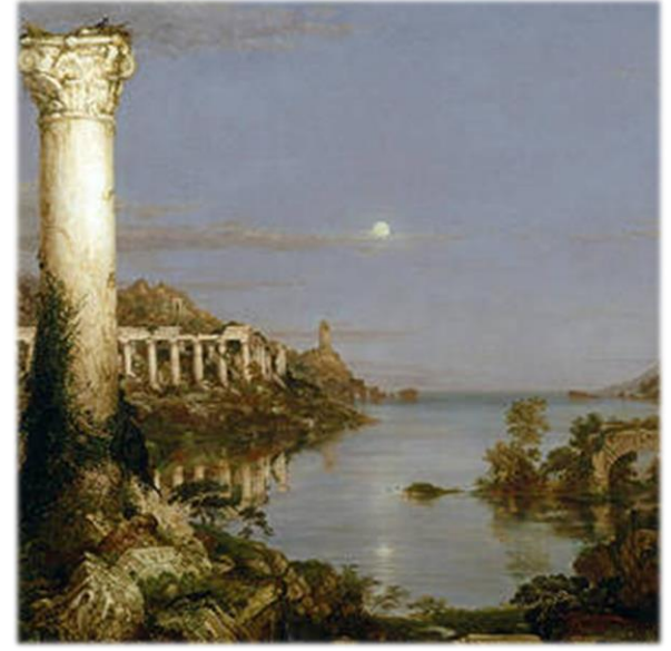
The Course of Empire. Desolation by Thomas Cole