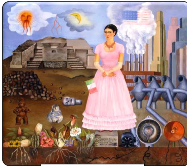
On the Border of Mexico and the United States 1932