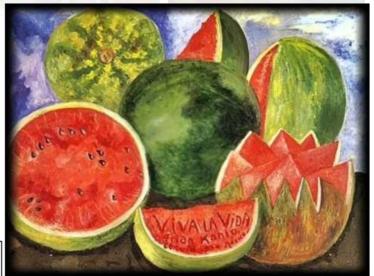
Viva la Vida, Watermelons (one of Frida's final paintings) 1954