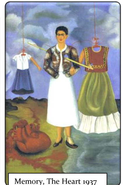
Memory, The Heart 1937